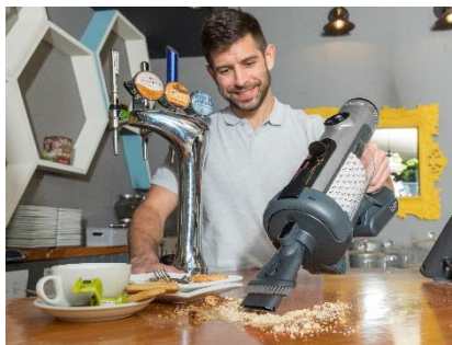
Handy 2-in-1 Combi Tool